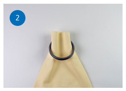
Take the sleeve and slide the connector over the bottom of it