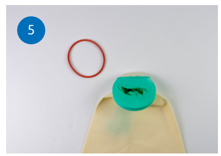
Pull the cuff of the glove over the connector