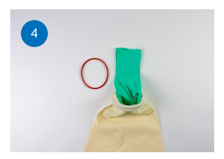
Take the glove and feed it through the cuff connector, fingers first