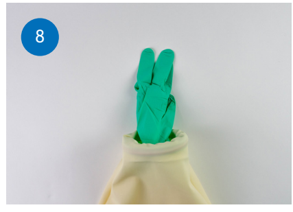
Turn the assembled sleeve and glove the correct way round